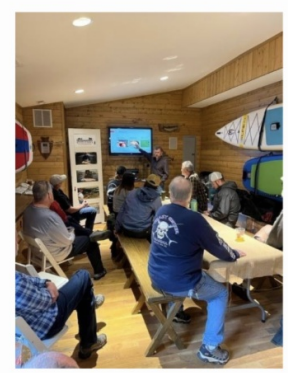
overview of aquatic insects